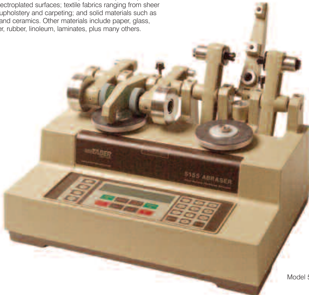
Model 5155 Shown